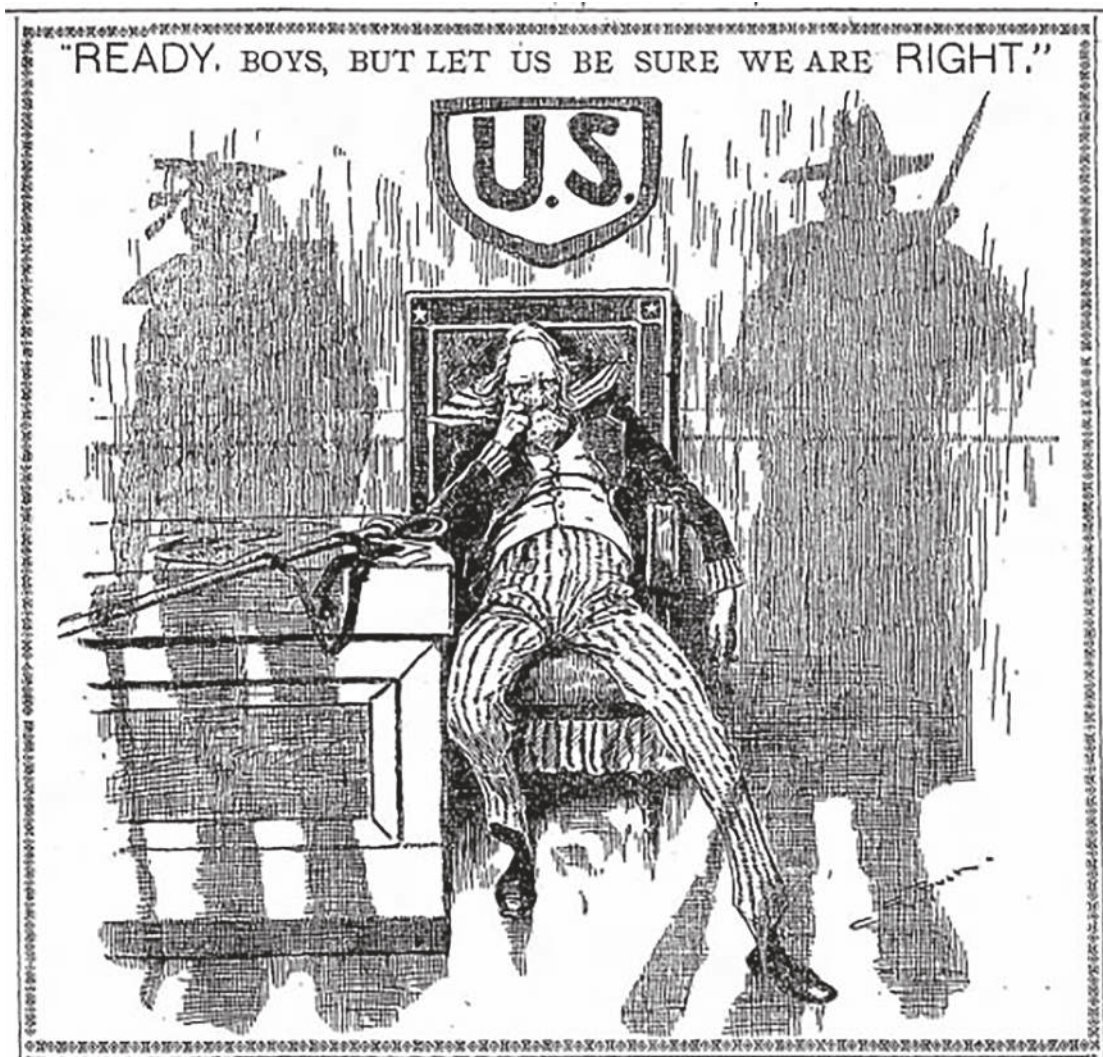
A cartoon published in the New York World newspaper, 21 February 1898. The figure in the middle represents the USA.