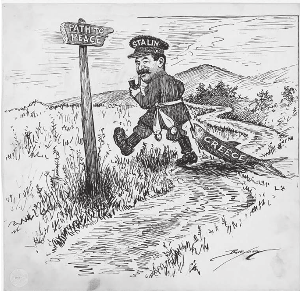
A cartoon published in the USA, 27 August 1946.

How far was the USSR the aggressor in the early years of the Cold War?