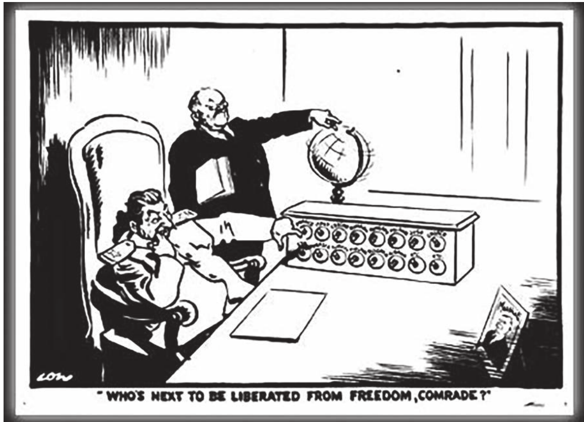
A cartoon published in Britain, 2 March 1948. The countries listed are: France, Italy, Czechoslovakia, Romania, Hungary, Poland, Yugoslavia, Greece, Persia, Turkey, Finland, Bulgaria, Albania etc. The photograph on the right is of Marshall.