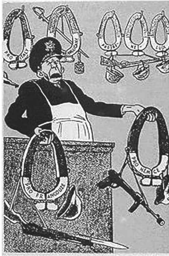
A cartoon by a Russian artist published in Czechoslovakia in 1949. Its title is 'The Marshall Plan in Practice'. Marshall is holding harnesses. The labels read 'for the French' and 'for the Germans'. The harnesses in the background have the names of other European countries on them.